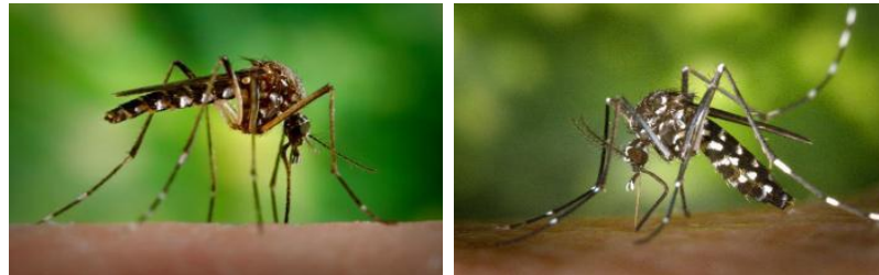
a) Aedes Aegypti